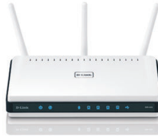
Wifi Router: D-Link N-300 Wireless N Gigabit Router DIR-655